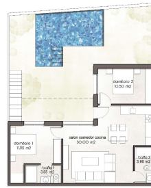
PB / GROUND FL.